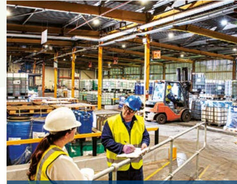
Augean's Berwick-upon-Tweed Hazardous Waste Treatment Facility