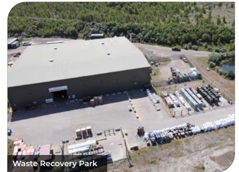
Waste Recovery Park